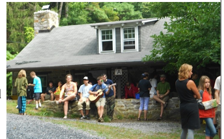
Catoctin Camp lodge